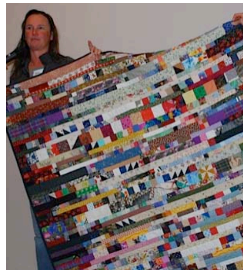
Dede Leece thought she was using up her scraps