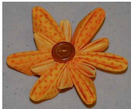
Origami flower from January's program

But what was MOST exciting was the number of hands that went up when I asked how many of them were planning to come to San Luis when WE, SLO Quilters, will be hosting their July 14th meeting!!!