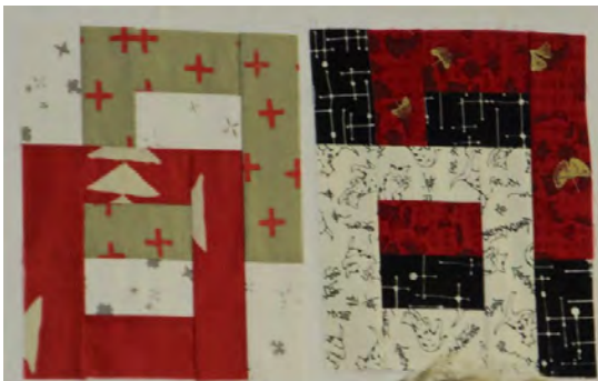
Mystery Block of the Month

Atascadero Sewing & Vacuum 5925 Traffic Way, Atas., 805-466-4772 atascaderosewingandvacuum.com