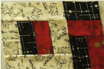
Mystery Block of the Month

Atascadero Sewing & Vacuum 5925 Traffic Way, Atas., 805-466-4772 atascaderosewingandvacuum.com