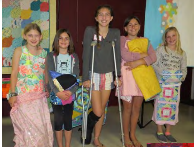
Youth quilters (above)

After Show and Tell. Meeting was adjourned at 8:00pm. The Members Spring Quilt Show followed.